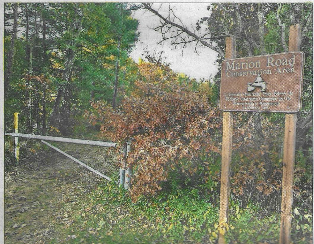
The Marion Road Conservation Area trailhead begins with a short walk along gas lines.