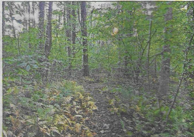
Several wooded trails are at the Marion Road Conservation area.

along a stone wall with a neighborhood on the other side to the wooded area, where there are