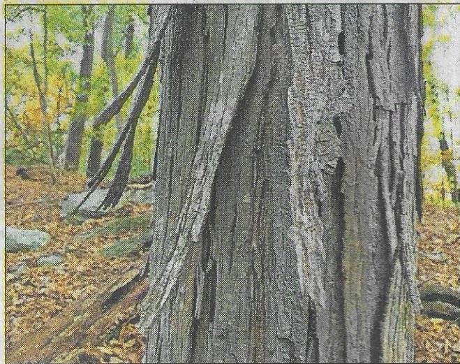
Shagbark hickory trees are seen throughout the area.