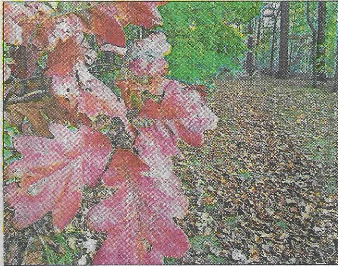
Fall adds a spot of color to the trails at Marion Road Conservation Area.

There are several access points to the Marion Road Conservation area, but Keeley recommends that visitors park on the trailhead next to the Pine Haven Cemetery on Lexington Road. Visitors will see a sign at the trailhead and will walk on a 40-foot wide strip of land next to the cemetery, along a stone wall, to an open area that runs along the edge of a back yard. Then you will follow the trail